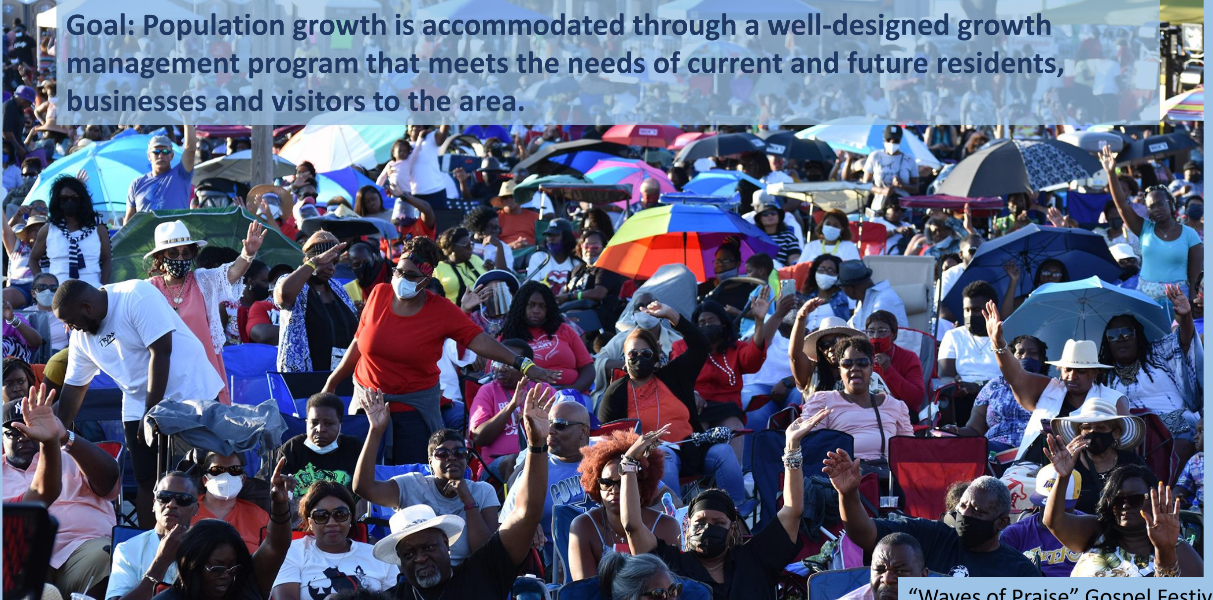
“Waves of Praise” Gospel Festival

Goal: Population growth is accommodated through a well-designed growth management program that meets the needs of current and future residents, businesses and visitors to the area.